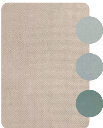
SD SEPIA 1