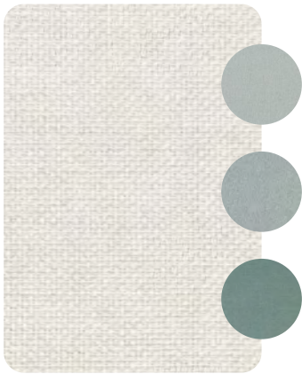
SD SALTY WHITE 2