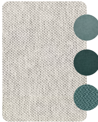
TC NEBBIA 2